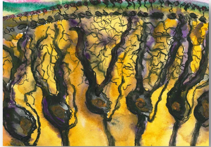
"Cerebellum Purkinje Cell" (Watercolor on paper) by Arne Starr